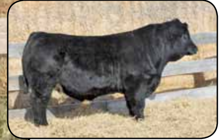
LW 1E - maternal brother

COME AS U R RED ROCKET MRL MISSILE 138C MRL MISS 2423Z MRL DISCOVERY 21A NUG RUBY 596C D BAR C BLK LACE 8119U