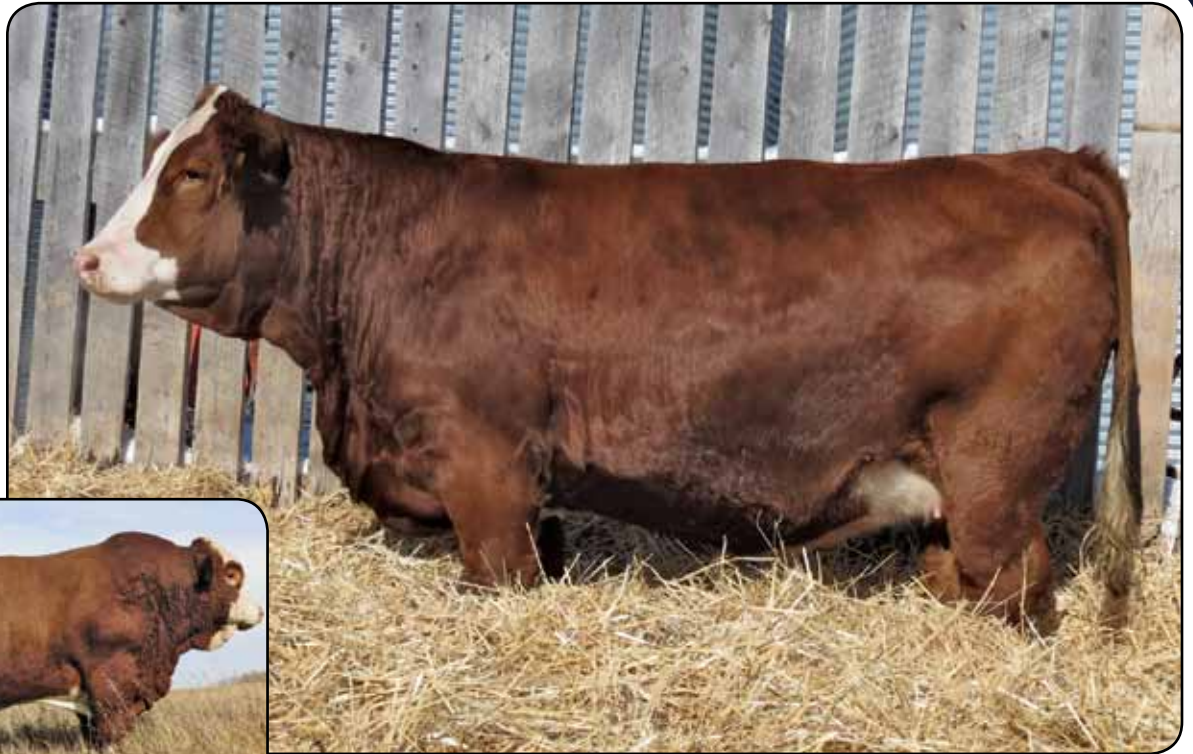
BEE Phantom 79B