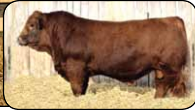
MRL Outlaw 255D