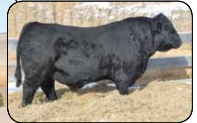
MRL Missile 138C