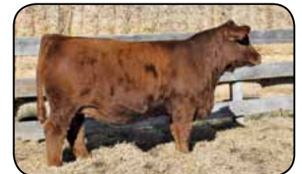
LW 3E - full sister

COME AS U R RED ROCKET MRL MISSILE 138C MRL MISS 2423Z 3D TRUSTIN 47T NAC WINNY 104B NAC WINCHESTER 50Y