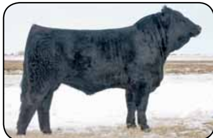
S-Paw Uproar 21U - Maternal grandsire

WHEATLAND BULL 215Z SCSF TURBO 40C BPTG1140051 LC BLACK 59T