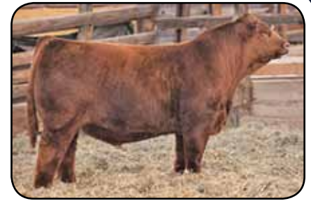
Rust Rio Grande 7022 - sire