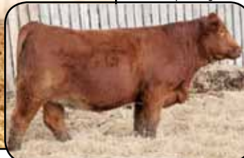
BLCC Miss Ponderosa 229B