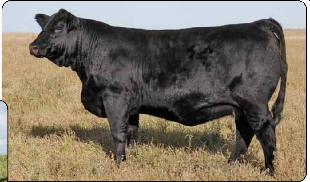
Mader VictoriaSecret 110B