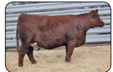
KWA Ms Circuit Breaker 198D

WFL WESTCOTT 24C RUST RIO GRANDE 7022 ET RF CERTAINLY FLIRTIN 202Z