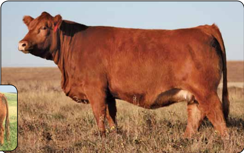
Dam - Deeg Ms Hot Topic 32B