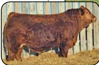
Erixon Magnum 69D