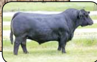
NCB Cobra 47Y