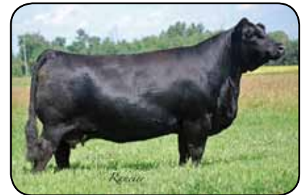
RF Certainly Flirtin 202Z- dam of sire