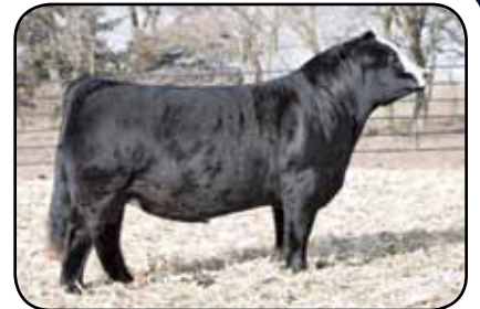
VCL LKC Equity 608D