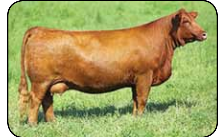
RF Certainly Flirtin 532C - sister to sire

WFL WESTCOTT 24C RUST RIO GRANDE 7022 ET RF CERTAINLY FLIRTIN 202Z