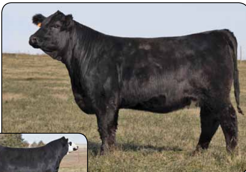
SFI Savage D20

Here is a female that we originally planned on retaining as she easily soared to the top of our 2018 heifer crop and easily ranks at the top of our bred heifer pen in 2019. This fancy fronted, free moving, well balanced heifer is sure to make a great addition to anyone's show string or front pasture. Shameless 3F is a female that screams femininity and just look at the stacking in her pedigree. Her dam comes from the great Shameless Hussey cow family from Rancier Farms and her sire is a Wheatland Exclusive 215 son that we retained in our herd. We couldn't be any happier to offer this bred heifer for your consideration.