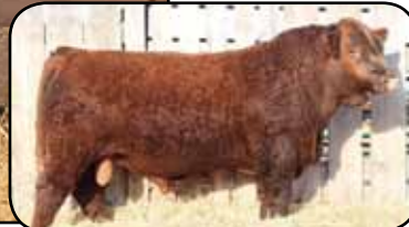
MRL Western Force 251B