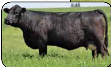
Skors Black Renowned 304Y- dam of sire