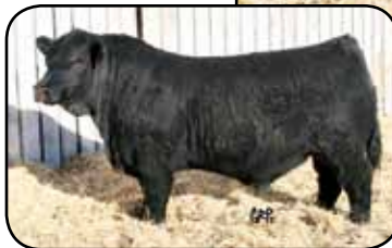
MI Mr Exceed 51F