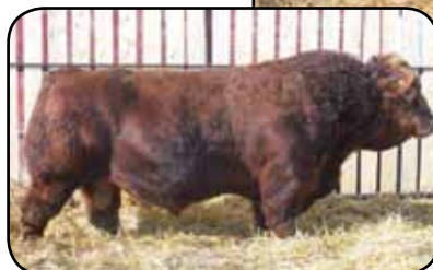
SVS Redstream 60X