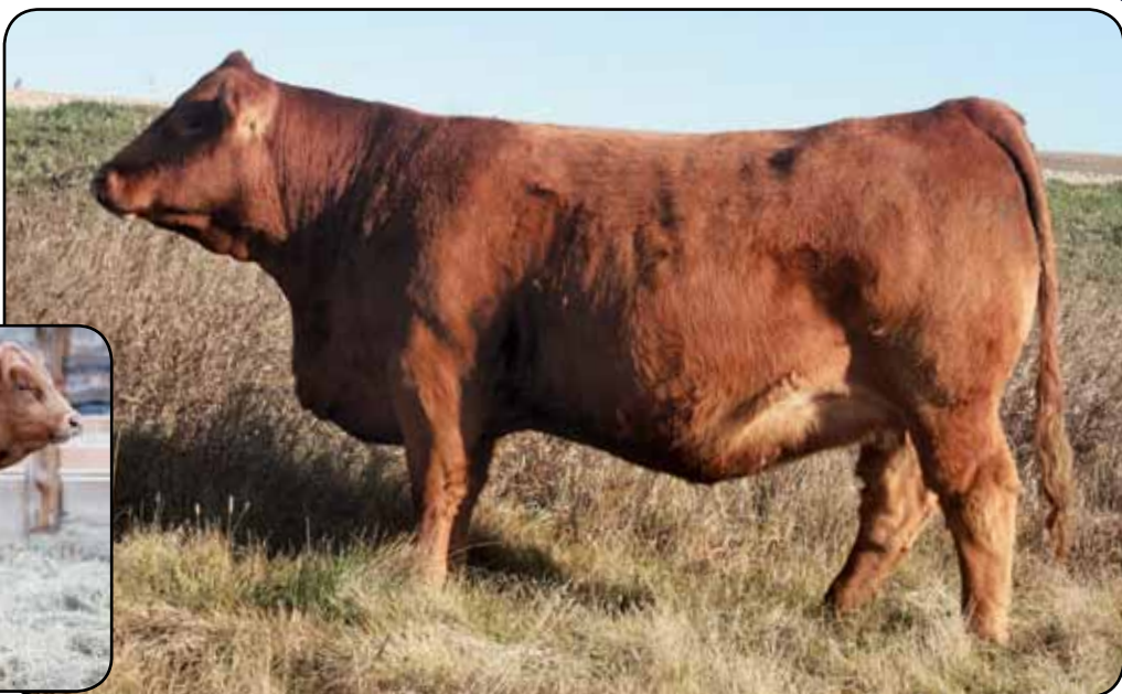
Rust Henn Rambler 6003