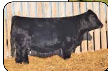
Maternal sib - Erixon Lady 78B