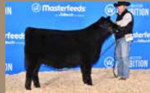
Anderson Barb Rose 1032 Daughter of Equity

Musgrave Equity 378 was purchased from Musgrave's in Illinois, the same place we bought Reflection from many years ago. He is a calving ease bull that still has power and is very maternal. His full sister is one of the best young cows at Musgrave's. All 5 bulls sired by Equity are out of first calf heifers and will be sure fire calving ease bulls. Equity daughters have exceptional udders with great milk production.