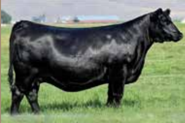
Coleman Chloe 9275 $375,000 daughter of Coleman Bravo

Bravo is one of the very best to come out of the Coleman program in Montana. The Coleman program is one we have admired for a long time and love the type of cows they raise. Bravo left an awesome set of calving ease bulls that will leave big time females.