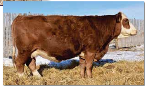
Kindred Spirit Iona 26A - Dam of Lot 9