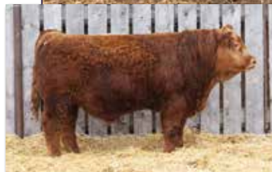
Pheasantdale Wrangler 9K Service sire of Lot 38