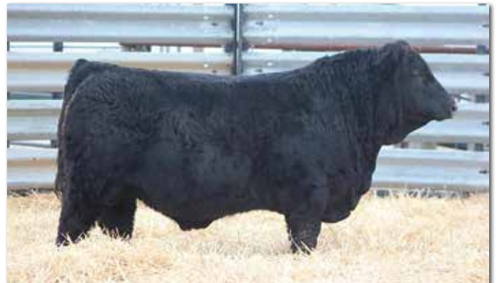
KWA Slider 196H - Service Sire of Lot 37