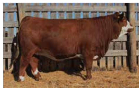
Keet's Harlequin 51H - Our high seller at last year's Fleckvieh Equation Sale and maternal sister to JKR 52J