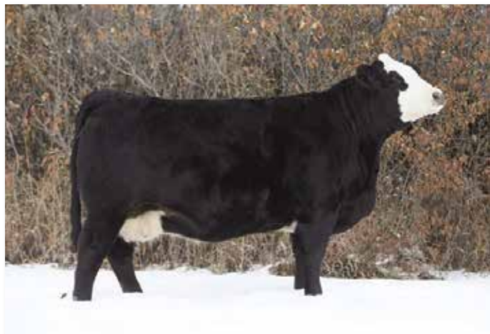
Double Bar D Pepsi 436E - Dam of Lots 48 and 49