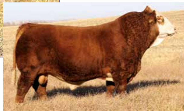
Sunny Valley Canon 86E - Sire of Lots 1 and 5

Bred April 18th to KSL PLD JESSE JAMES 49J (CSA #1381057) No Exposure.