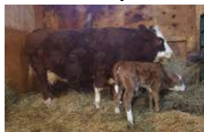
XRC Dominique 19D with Keet's Kenna 12K Dam of Lot 20

Exposed to Clearwater HP Knox 61K March 31 to May 29. Observed bred April 12th. Ultrasound safe to observed breeding date.