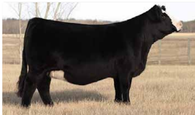
TY-D's Elegance 25H - Dam of Lot 46