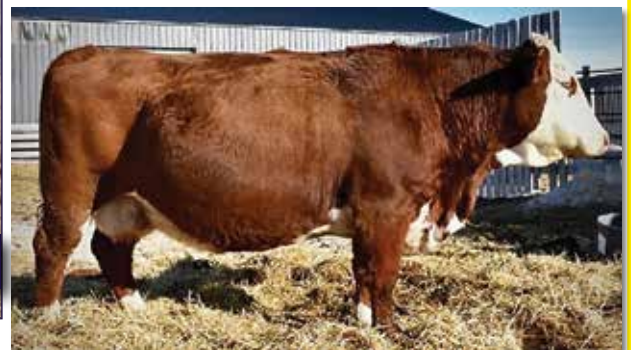
Kindred Spirit Helga 29Z - Dam of Lot 17

100% Fleckvieh. Hetero Polled. We are extremely excited to offer this heifer for sale. She's smooth polled, thick and stylish. Her pedigree is outstanding and backed by great cow families on both the paternal and maternal side. Her grand dam, Helga 3E, was our first ever foundation cow so kind of special. Her dam has raised outstanding bulls that have ended up in purebred breeding programs and her flush calves have been high sellers. She is sired by Kindred Spirit Helios, who was purchased by Aumack Simmentals. Kelt is loaded with potential and will be an excellent addition to any program.