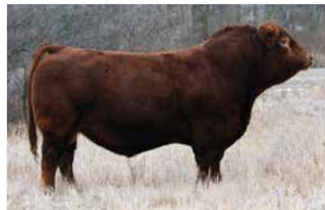
WS Epic E152 Service sire of Lot 28