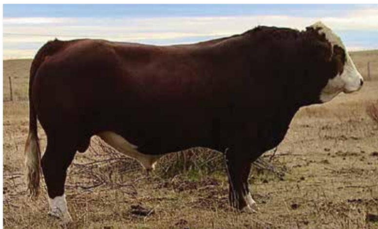
Anchor D Fabulous - Sire of Lot 11, Service Sire of Lots 10, 12, 13.-17