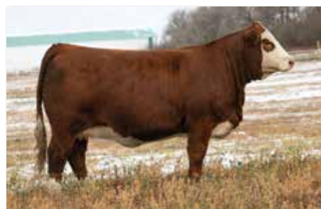
Double Bar D Adora 98G Dam of Lot 54

Consigned by: Karsin Farms, First Class & Sandy Hills Simmentals