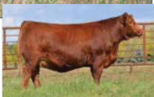
Erixon Lady 49E Dam of Lot 26