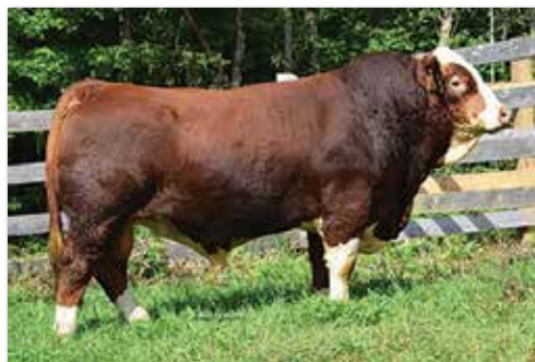
Anchor D Raptor 392C Sire of Lot 51