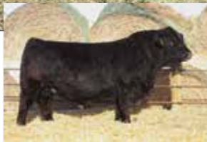
FWSF New Era 4G Sire of Lot 53