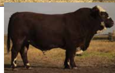
Fairview Evolution 318H Sire of Lot 21