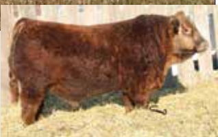
WFL WEestcott 24C Grandsire of Lot 27