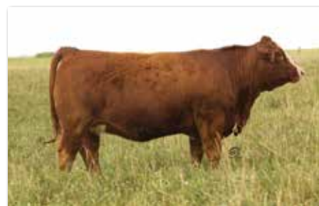
T33 MS Genesis 10G Grand Dam of Lot 45