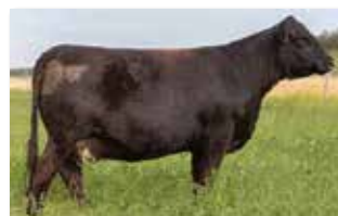
Springcreek Mickey 26G Dam of Lot 23