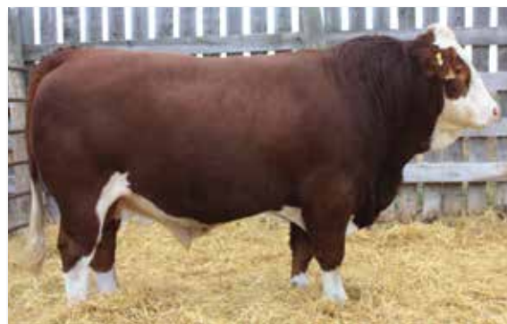
Clearwater HP Knox 61K - Service Sire of Lots 18-22