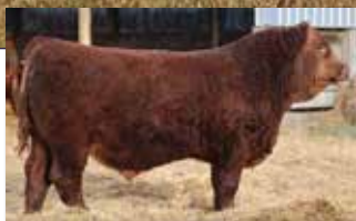
Springcreek Maverick 48H Service sire of Lot 27