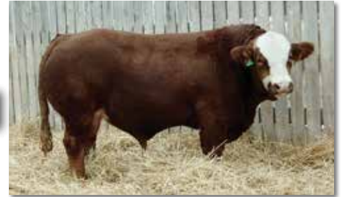
Kindred Spirit Ezana 1C - Sire of Lot 12, 13 & 16. Service Sire of Lot 9