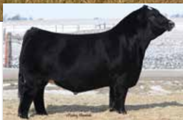
GSC GCCO Dew North 102C Service sire of Lot 29