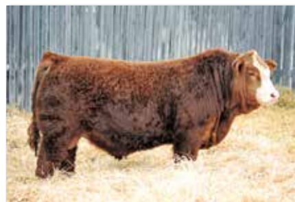
WLB Top Tier 456G Service Sire of Lot 24