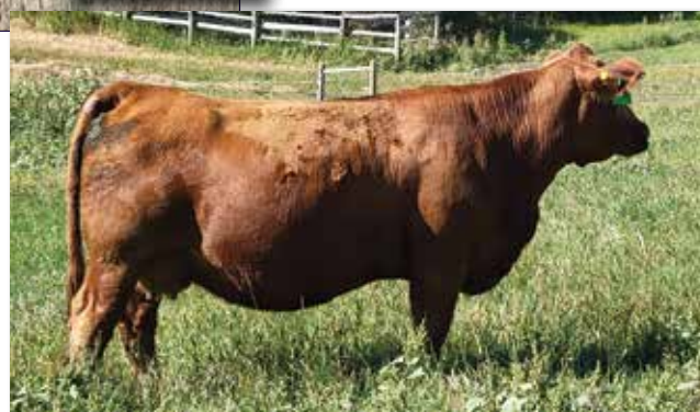
East Poplar Brittany 908G - Dam of Lot 33