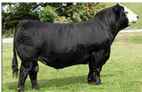
IRCC DLC King George 905G Sire of Lot 28