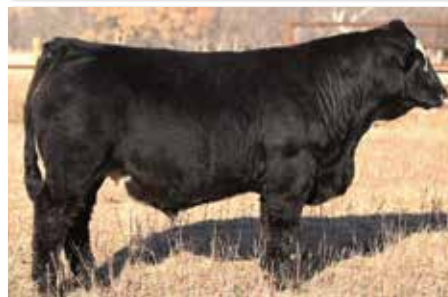
R Plus 2227K Service Sire of Lot 52