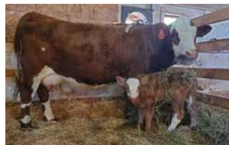
Keet's Fatima 20F with Keet's Juggi 52J Dam of Lot 18

Ultrasound safe to observed breeding date.