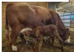
Keet's Faelyn 53F with Keet's Kaylyn 50K - Dam of Lot 22

Exposed to Clearwater HP Knox 61K March 31st to May 29th. Observed bred April 10th. Ultrasound safe to observed breeding date.