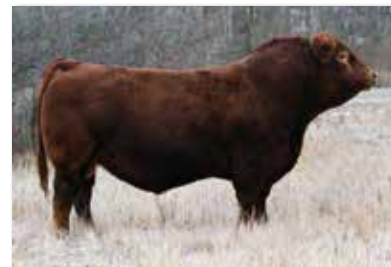
WS Epic E152 Service Sire of Lot 48

A.I Bred to WS Epic E152 on April 1st. Safe. No exposure.