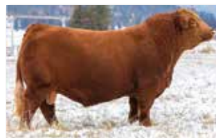
Mader Walk the Line 92J Sire of Lot 23