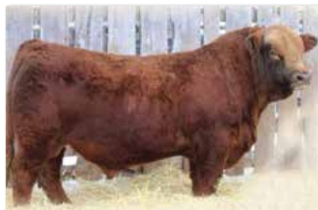
MRL Boa 204F Sire of Lot 52

Breeding: Exposed to R Plus 2227K March 28th to June 5th Observed Bred March 31st