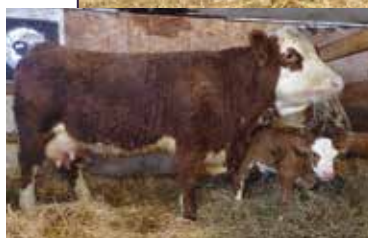
Keet's Esmeralda 3E with Keet's Kezzia 36K - Dam of Lot 21