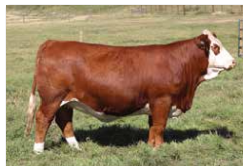
Black Gold Ms Kali 245J Dam of Lot 55

Consigned by Cold Creek Land & Cattle and First Class.