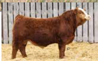
Pheasantdale Honkytonk 8K Service sire of Lot 26