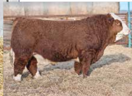
KSL PLD JESSE JAMES 49J Service Sire of Lots 1 and 2 and 4 and 5.

Bred April 15th to KSL PLD JESSE JAMES 49J (CSA #1381057) No Exposure.