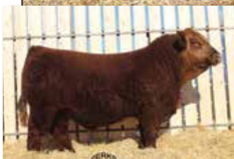
PERKS POTENT 309H Sire of Lot 8