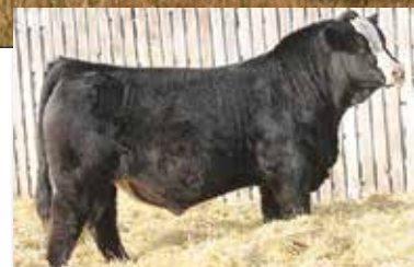
Mader Son of Anarchy 144H Sire of Lot 29